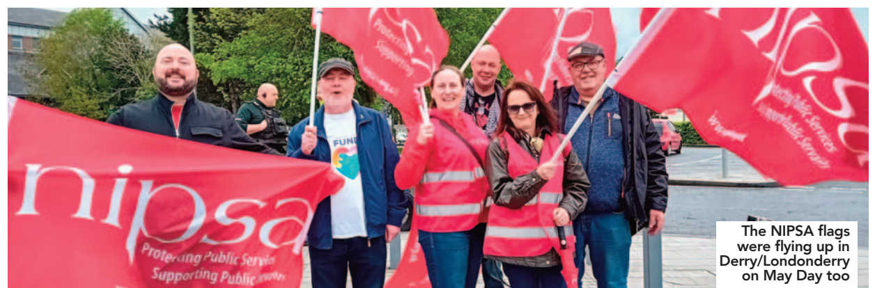
The NIPSA flags were flying up in Derry/Londonderry on May Day too